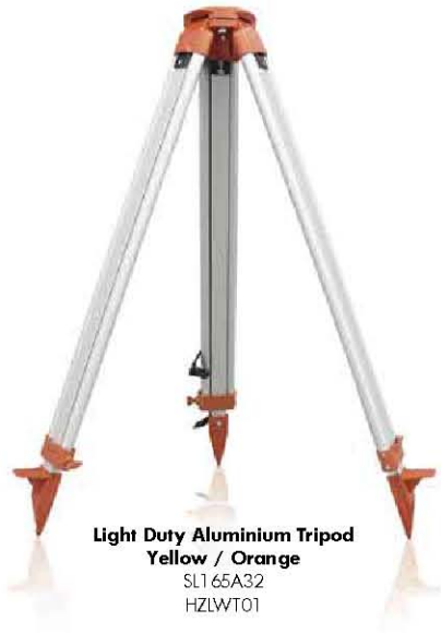
Light Duty Aluminium Tripod Yellow / Orange SL1 65A32 HZLWT01