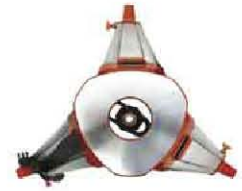
11cm Tripod Head