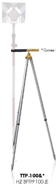
TTP-100* HZ BPTPP100-JE