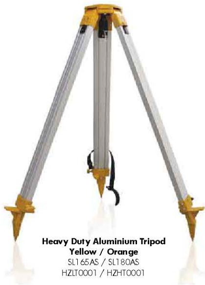
Heavy Duty Aluminium Tripod Yellow / Orange SL1 65AS / SL1 80AS HZLT0001 / HZHT0001

Similarly there is also a host of specifications you can choose from to suit your needs, from the Tripod height to Tripod head shape to even locking mechanism, you will find what you specifically want.