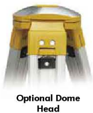
Optional Dome Head