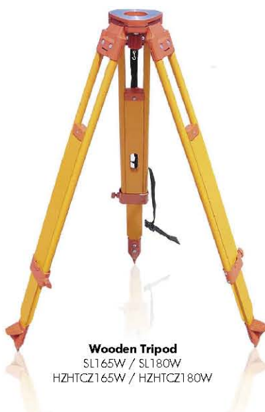
Wooden Tripod SL165W / SL180W HZHTCZ165W / HZHTCZ180W