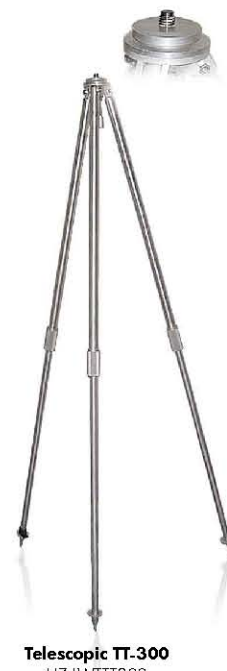
Telescopic TT-300 HZ LWTTT300