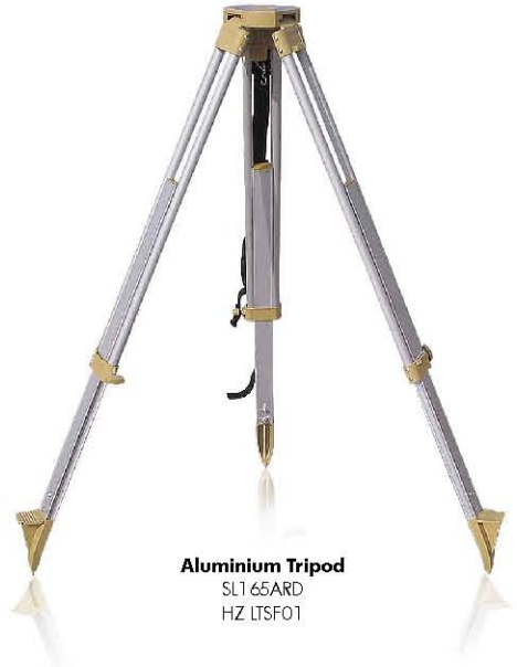
Aluminium Tripod SL1 65ARD HZ LTSF01