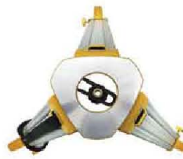
14cm Tripod Head