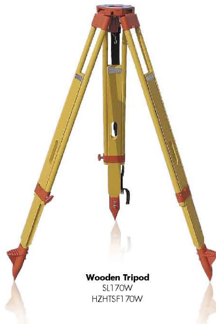
Wooden Tripod SL170W HZHTSF170W