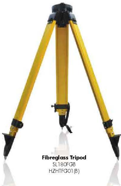
Fibreglass Tripod SL180FGB HZHTFG01(B)